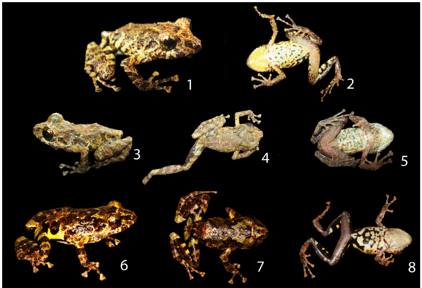
Figures 1–8. Living specimens of Pristimantis divnae . 1: Lateral, and 2: ventral view of MHNC11206 from the Machiguenga Communal Reserve, Cusco; 3: lateral, 4: dorsal, and 5: ventral view of MHNC11203 from Timpia Native Community, Cusco; and 6: lateral, 7: dorsal, and 8: ventral view of MHNC14480 from the AmaraKaeri Communal Reserve, Madre de Dios, Peru.