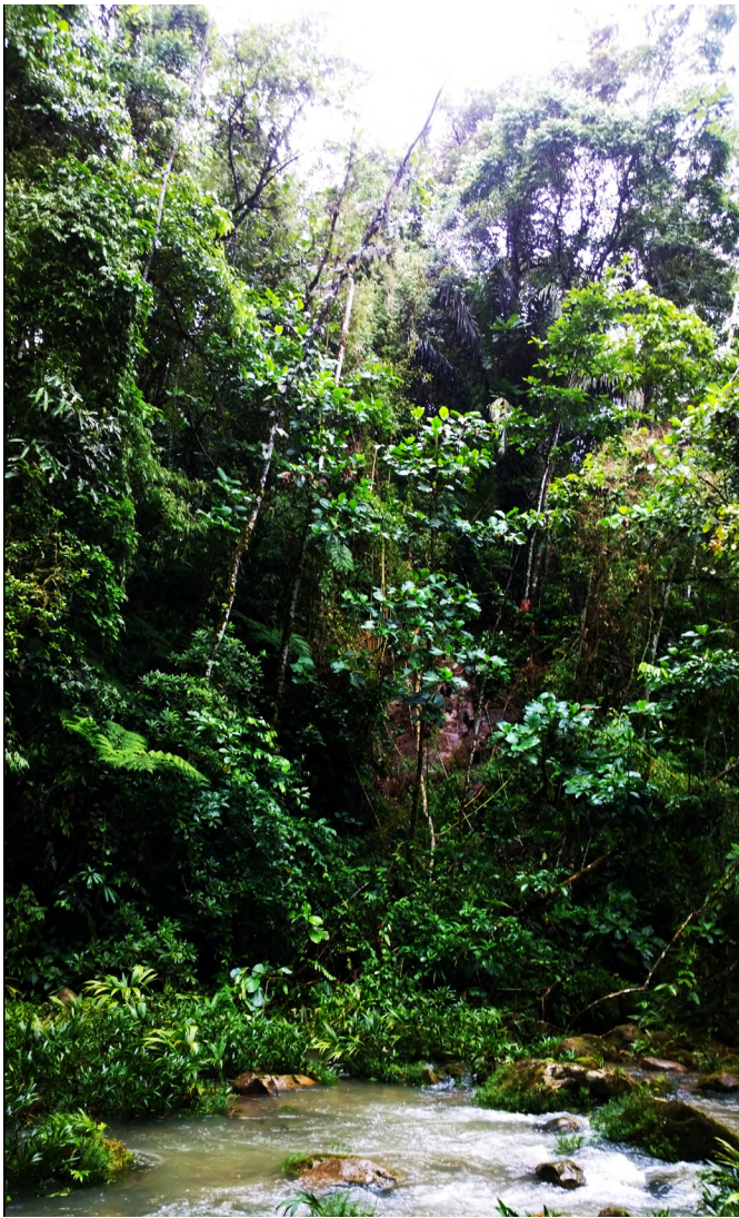
Figure 11. Premontane forest habitat of Pristimantis divnae (Amarakaeri Communal Reserve, Peru).

second and third records of P. divnae within a national protected area. We also report premontane forest as additional suitable habitat for this species in southern Peru (Figure 11; Gentry 1995). These new records lend credence to the species' IUCN listing as Least Concern. Although P. divnae is apparently locally rare, its range seems to be more widespread than initially thought (IUCN SSC 2013). The discovery of P. divnae within such proximity to the Amarakaeri Communal Reserve and Machiguenga Communal Reserve also suggests that these national protected areas may be particularly important for maintaining connections between populations of the species in neighboring conservation concessions and national parks.