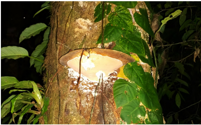
Figure 9. Pristimantis divnae (MHNC14480) was perched on the bracket fungus pictured when encountered in the Amarakaeri Communal Reserve, Madre de Dios, Peru.

Figures 1 and 2) was collected on 16 August near the Machiguenga Communal Reserve (MCR), department of Cusco, Peru (12°10'41.63" S, 073°0'9.67" W, 695 m a.s.l.), and two males (MHNC11203, MHNC11205; Figures 3–5) were collected on 26 August at Timpia Native Community (TNC), department of Cusco, Peru (12°4'52.68" S, 072°47'58.33" W, 498 m a.s.l.). All were found perched on branches at 1.5 m above ground. During a more recent expedition to a site in the southern